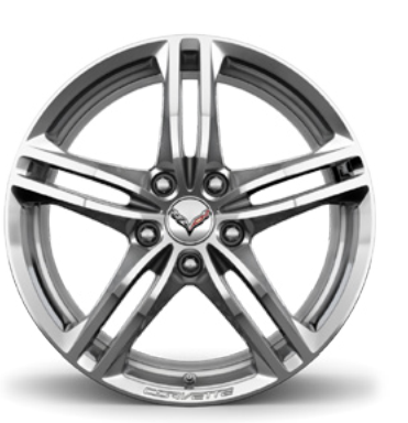
(QX3) Available Chrome Aluminum<sup>2</sup>