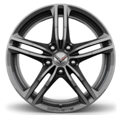
(QG6) Standard Silver-Painted Aluminum<sup>2</sup>