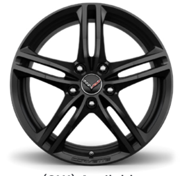
(QX1) Available Black Aluminum<sup>2</sup>