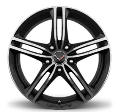
(RPK) Available Black Machined Aluminum