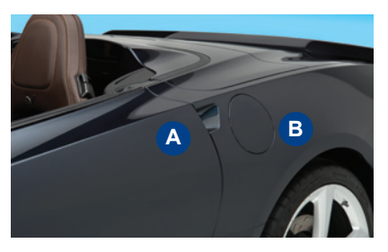
Fuel Door: The vehicle must be unlocked to open the fuel door. With Passive Locking active, the driver's door must be opened first before the fuel door will unlock. Press and release the center rear edge of the fuel door (B) to open it.

The Keyless Access System enables operation of the doors, ignition and trunk/hatch without removing the transmitter from a pocket or purse. The transmitter must be within three feet of the door being unlocked or the trunk/hatch.